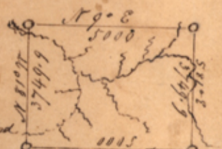
Scale 4000 varas to the inch