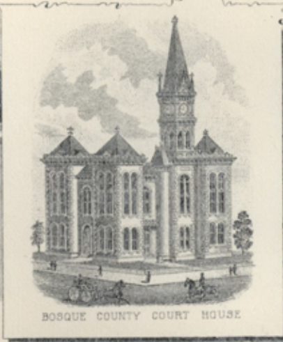
BOSQUE COUNTY COURT HOUSE