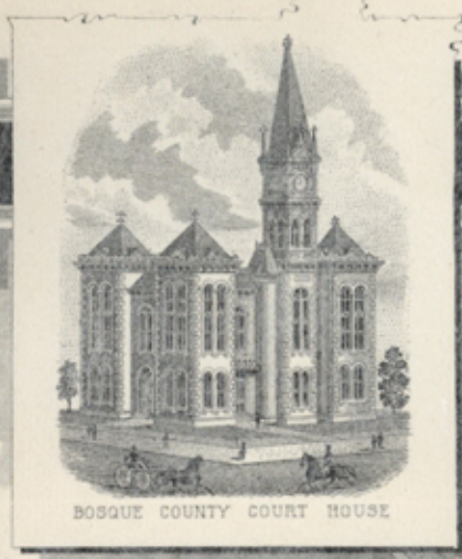
BOSQUE COUNTY COURT HOUSE