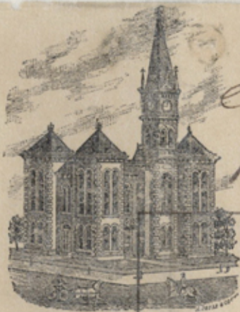
BOSQUE COUNTY COURTHOUSE.