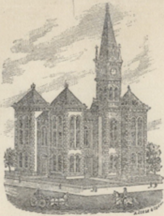
BOSQUE COUNTY COURTHOUSE.