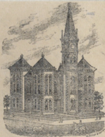
BOSQUE COUNTY COURTHOUSE.