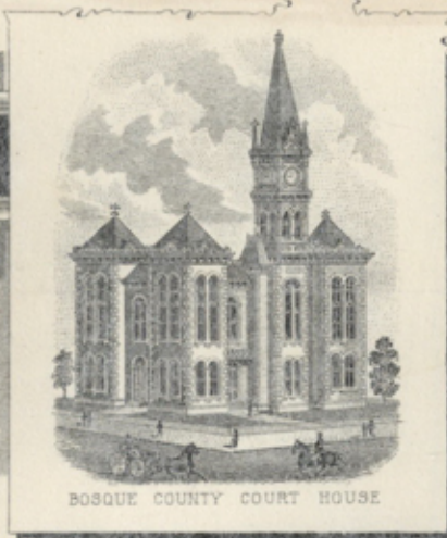
BOSQUE COUNTY COURT HOUSE